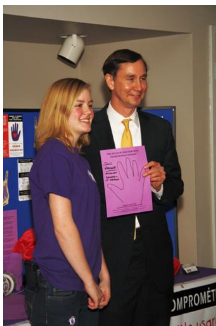
Hands are not for Hurting Pledge

Floral Arrangements: The White Rose Custom Floral Design