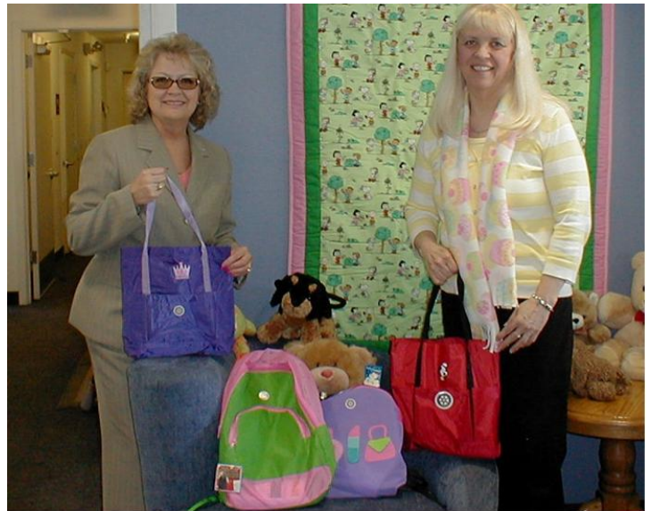
Albany Rotary Club provides Personal Care Bags for Children!