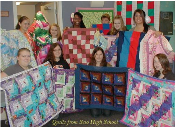
Students from Scio High School donate quilts made in class.