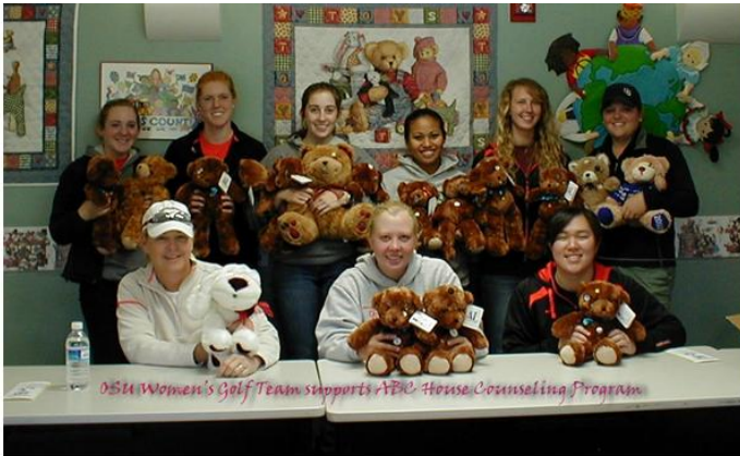
OSU Women's Golf Team transform stuffed animals into therapy tools.